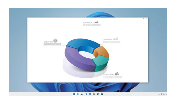
Wireless Presentation on 16:9

Screen sharing via NovoConnect software | AirPlay