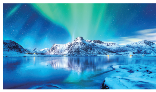
Extended Screen (serve as the secondary screen to User's laptop)